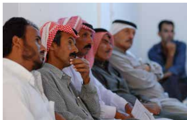
Capacity building is key for making agricultural practices climate-resilient. Here, Jordan farmers are attending a consultative meeting on irrigation.

» Cross-cutting strategies affect both supply side mitigation and demand-side improvements. This may include, for example, certification systems and emission-tracking for supply-side entities, which could influence consumer preference on the demand side. Such approaches are not in common usage for climate-related indicators.