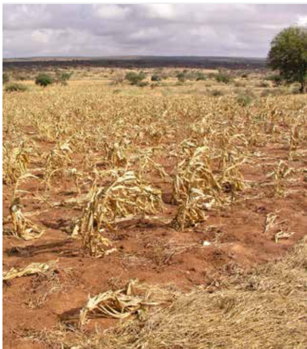
Climate change in conjunction with soil erosion poses serious threats to agriculture.

Figure 1 shows that more than half of these emissions came from enteric fermentation and manure in the live-stock sector, with direct emissions from arable agriculture and the burning of savanna and crop residues accounting for the remainder (FAOSTAT 2016). Figure 1 also shows that the majority of emissions from the agriculture sector are from developing countries and that emissions from these countries are forecast to continue to increase under current policies 1 . Agricultural emissions from developed