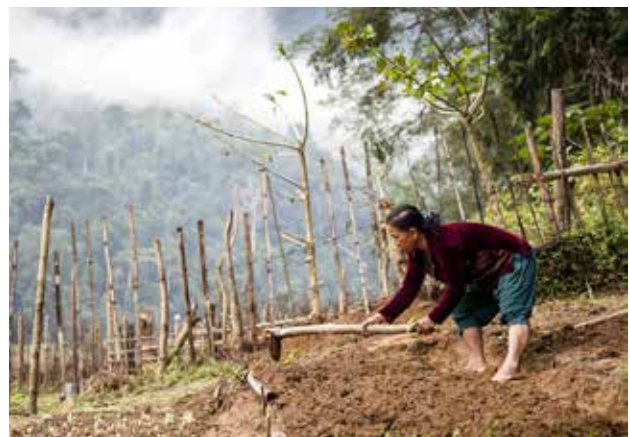
Agriculture and forests are both important sources of GHG emissions and carbon sinks.

Although agriculture targets are generally included in the NDCs of developed countries more often than for developing countries, a far greater proportion of developing country NDCs refer to concrete policies and measures for mitigation in agriculture (FAO 2016b). Similar to other sectors where climate has not yet been mainstreamed, the agriculture sector's comparatively low level of integration